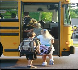
Inside this Issue